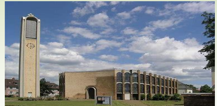
St Konrad Church Karlsruhe