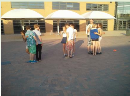
Welcome Games Nottingham 2013