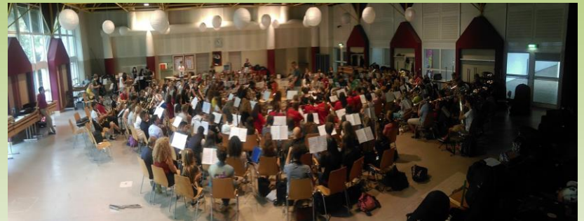
Joint Rehearsal Karlsruhe 2015