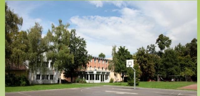
Karlsruhe Youth Hostel

(Wet Weather alternative: Carl Benz Halle, Pfaffenrot)